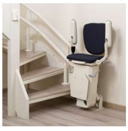
Folded away, the stairlift is very compact. The mechanism is cleverly concealed.