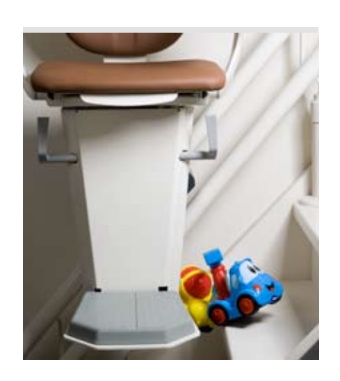
The least resistance will stop the stairlift immediately.

Safety, comfort and reliability are the foremost aspects of this design. The comfortable seat and back support ensure that you feel secure and at ease. The Ruby is provided with many safety features, such as a safety belt. If the lift comes up against the slightest resistance, it stops immediately. And on arrival at your destination, you simply give the seat a quarter turn, thus forming a barrier across the stairwell and allowing you to step off safely and easily.