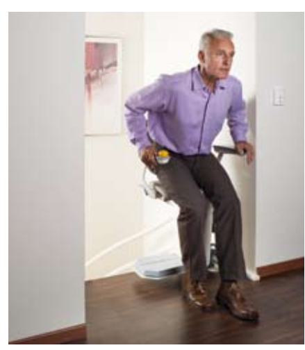
Getting on and off at the top of the stairs is done safely by simply giving the seat a quarter turn.