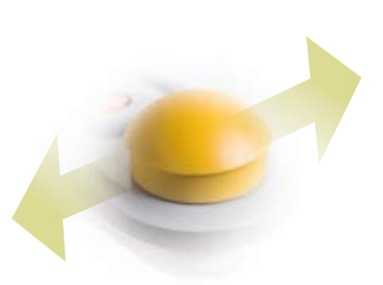
The comfortable chair ensures that you move safely and relaxed between floors. You set the stairlift in motion using the yellow ball on top of the armrest.