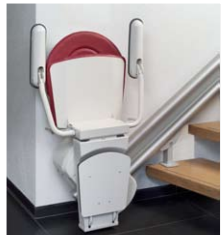
↑ The mechanism is concealed subtly and compactly.