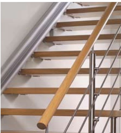
↑ The aluminium track is very stylish.

The Jade is simplicity itself to operate. It has, as standard, wireless remote control for summoning and sending the lift. You set it in motion using the yellow operating ball on top of the armrest. The unique ball shape enables anyone to operate the lift easily and without effort. A 'soft' start and stop contributes to the comfort of the ride – the lift starts and stops shock-free. Thanks to a continuous transmission between the various speeds, the ride quality up and down is smooth. Once you have stepped off, the chair can be easily folded away.