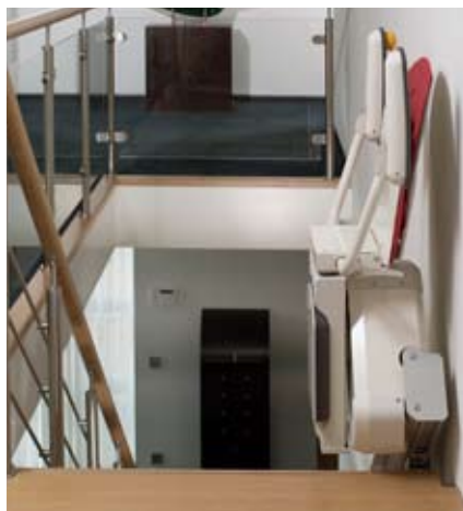
↑ Thanks to the clever design, the stair remains freely accessible.